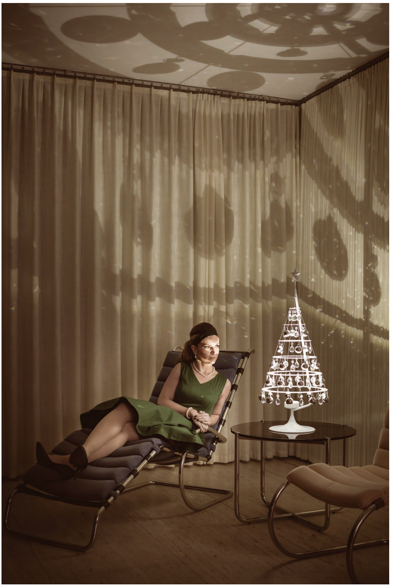
The Jubilee Tree available at www.ModernChristmasTree.com/shop